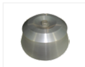
6 × 300ml