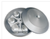
6 × 1000ml