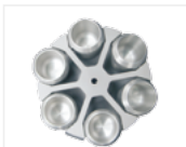
6 × 500ml