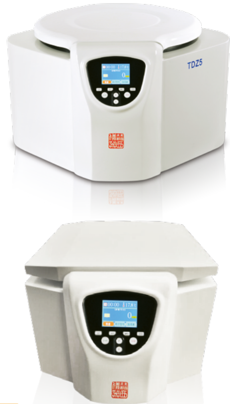
48 × 5ml